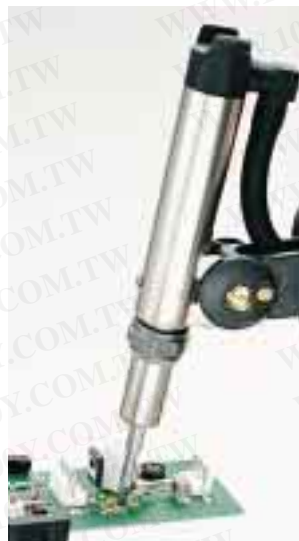
ZD905V with extended desoldering tip