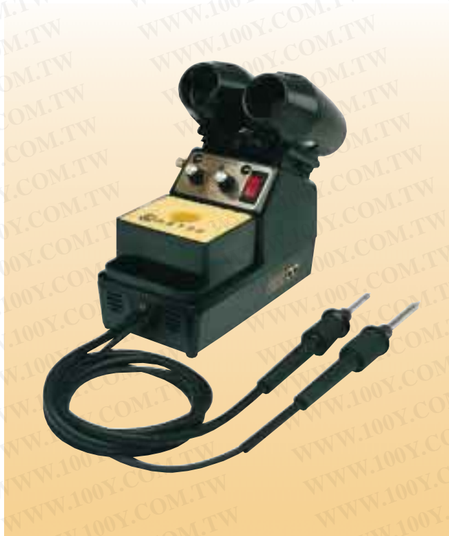
1052 is a SMT hot air and standard soldering station

A versatile hot air and soldering station that runs on shop air or nitrogen. Small and easy to use, the 1052HP works well on everything from small chip caps to 84-pin PLCC devices.