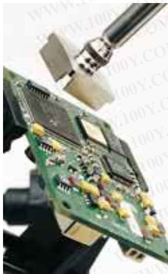
ZD905V-HP with CROWN tip