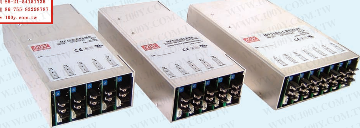
MP450 (450W, 5 SLOT)