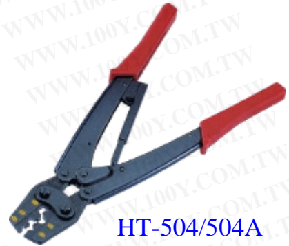
HT-504/504A 12.4" (315mm) HEAVY DUTY TYPE

Crimper made of carbon steel and hardened