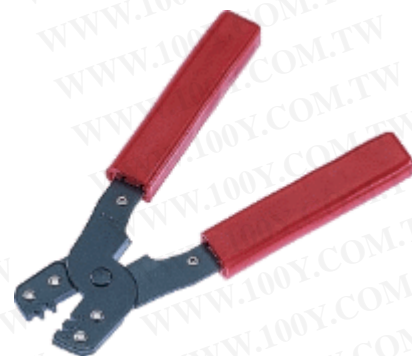
HT-213 6.9" (175mm)

Use with HT-1091 or HT-223 for stripping wire.