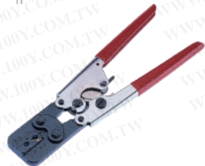
HT-482 9" (229mm)