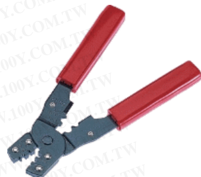
HT-202B 7.3" (185mm)