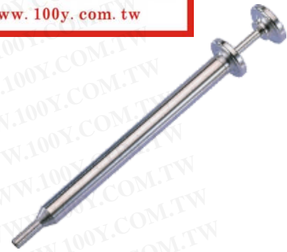
HT-319 5" (127mm)