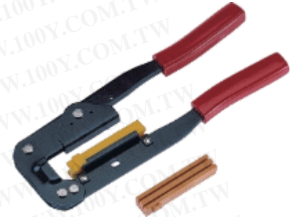
HT-214 9.5" (241mm) PATENTED