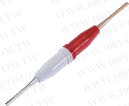
HT-101 4" (102mm)