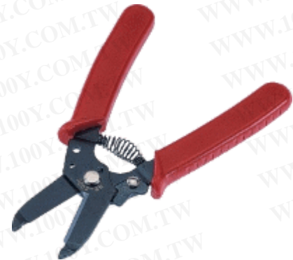
HT-502C 6.6" (168mm)