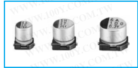
Marking color : Black print