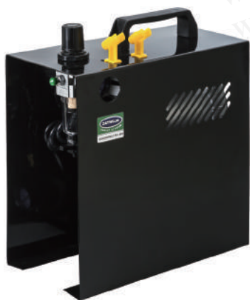
TC-20TS A Type