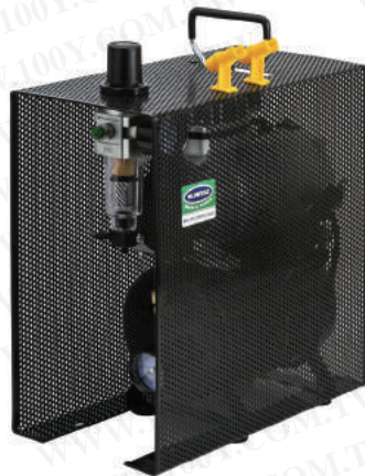
TC-20TS B Type