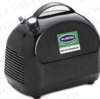
TC-10 A Type