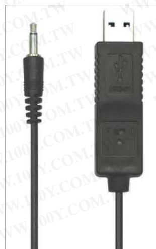
USB cable, Model : USB-01