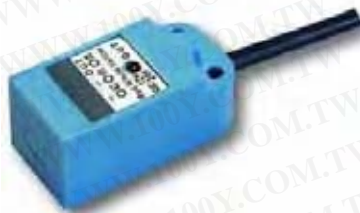
PX-01 Proximity sensor