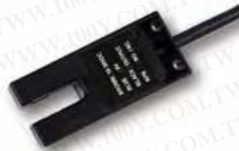
PI-06 Proximity sensor