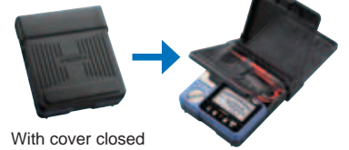
With cover closed