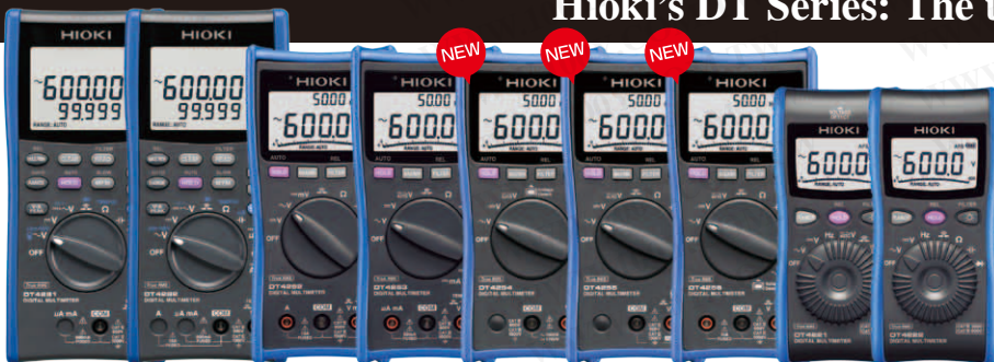
DT4281 DT4282 DT4252 DT4253 DT4254 DT4255 DT4256 DT4221 DT4222

Hioki's DT Series: The ultimate line of digital multimeters