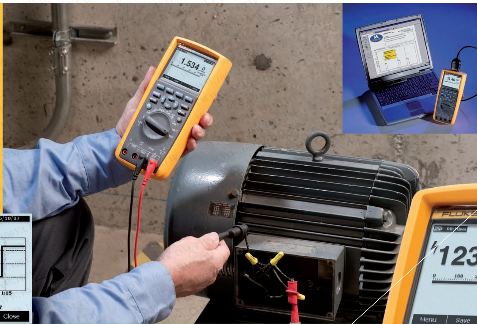
Transfer data to PC using optional cable and FlukeView Forms Software