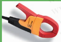
i400 Current Clamp

For more information on how the Fluke 289 True-rms Industrial Logging Multimeter with TrendCapture can help you, go to www.fluke.com/289 .