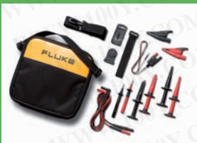
TLK289 Electronic Test Lead Kit