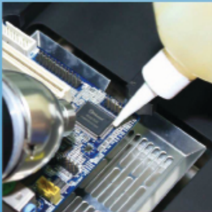
Apply flux and preheat PCB