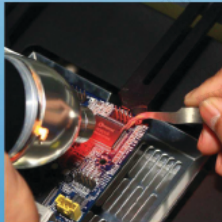
Heat component with IR handtool