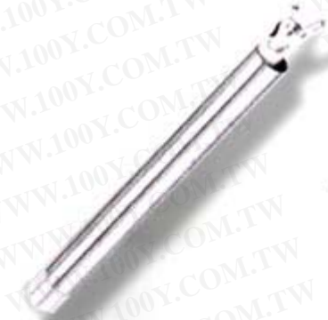
HEATING ELEMENT SR-965NH