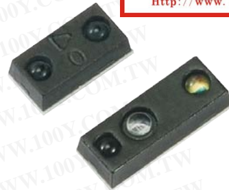
(Upper left) Proximity sensor <GP2AP002S00F> (4.0 × 2.0 × 1.2 mm) (Down right) Proximity sensor with integrated ambient light sensor <GP2AP002A00F> (5.6 × 2.1 × 1.2 mm)