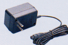
AC adapter MCP-TA05