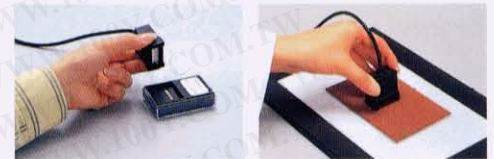
Use the probe checker to inspect probe connection. Put the probe perpendicular to the sample.