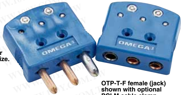
OTP-T-F female (jack) shown with optional PCLM cable clamp.

Both shown slightly larger than actual size.