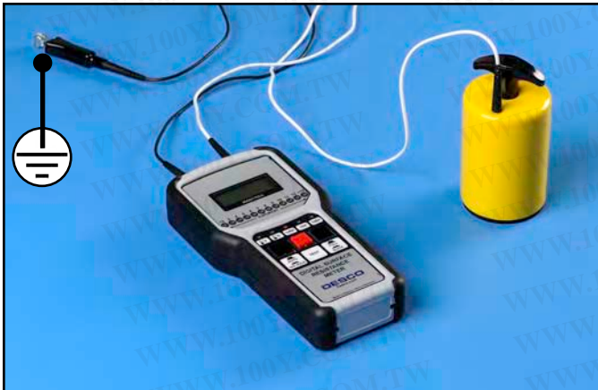
Figure 5. Rtg test setup

If the measurement is outside acceptable limits, clean the surface with an ESD cleaner containing no insulative silicone such as Reztore™ Antistatic Surface & Mat Cleaner , and re-test to determine if the cause of failure is an insulative dirt layer or the ESD worksurface material.