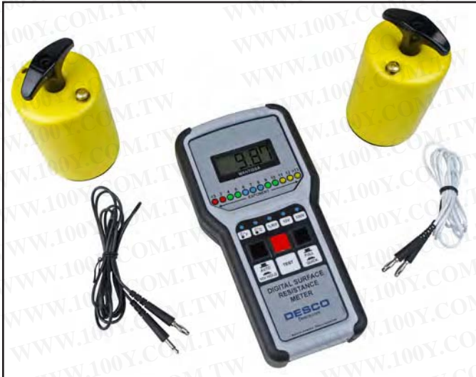
Figure 1. Desco Digital Surface Resistance Meter Kit