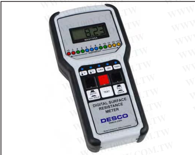
Figure 3. Desco 19788 Digital Surface Resistance Meter