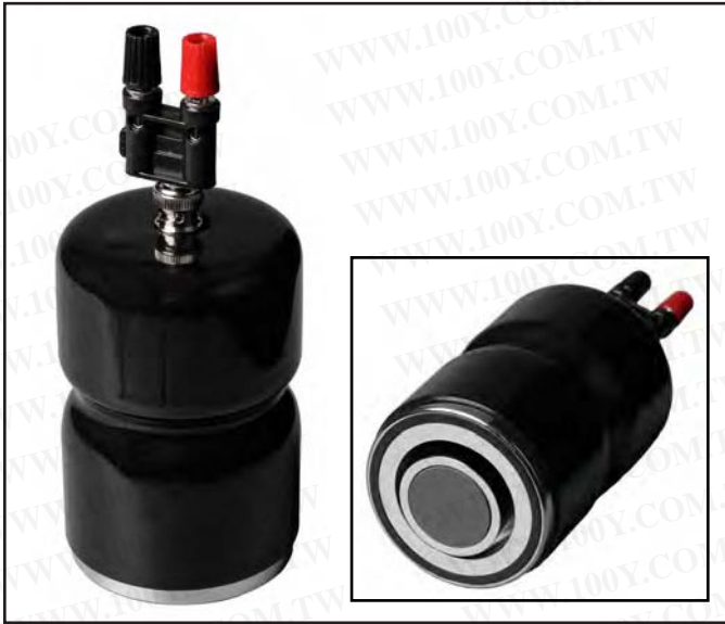
Figure 7. Desco 50005 Concentric Ring Probe

The Desco 50005 Concentric Ring Probe is an instrument to be used in conjunction with a resistance meter, such as the Desco 19787 Digital Surface Resistance Meter, to measure surface resistance per ANSI/ESD STM11.11 the test method listed in Packaging standard ANSI/ESD S541 for surface resistance of planar materials.