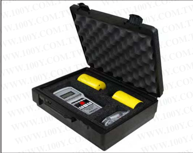
Figure 2. Desco 19787 Digital Surface Resistance Meter Kit